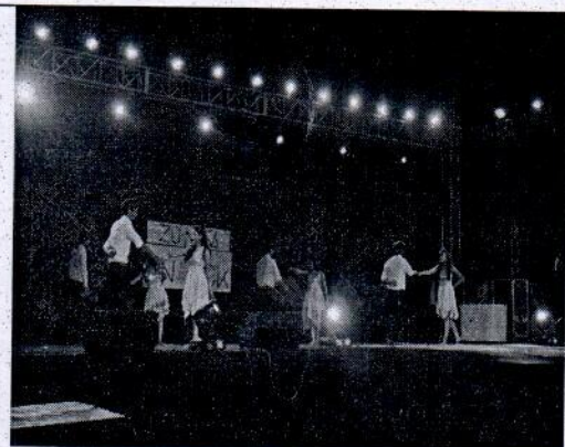
Figure 2 Zonal NASA 4 October,2015