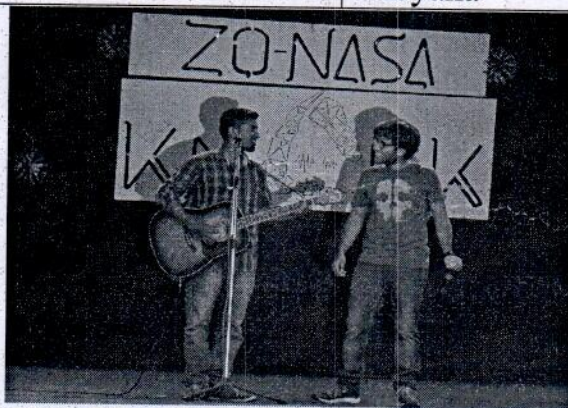
Figure 1 Zonal NASA 2 October,2015